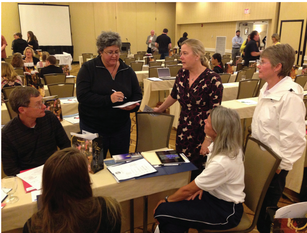
Day before SPEAK Out! Day planning session

and physical education professionals, and advocate for legislation that advances their mission. For example, in recent years attendees at SPEAK Out! Day have advocated for health and physical education programs as part of the Every Student Succeeds Act (SHAPE America, 2016).